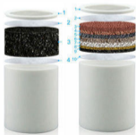
Conventional 10 Stages